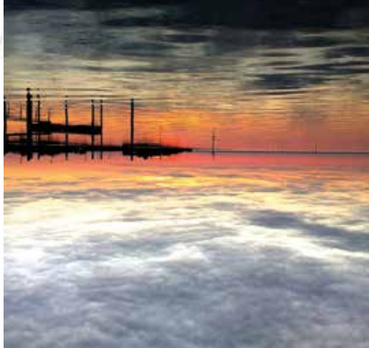
Sunrise on Dock Road